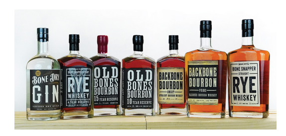
BIGGEST BADDEST BOLDEST BOURBON IN INDIANA!

Tasting Notes: Subtle hints of rose petals and ripe cherries on the nose. The cherry carries over intensely to the palate to provide a warm and satisfying sensation. This is a tremendously balanced and integrated whiskey that has nuanced richness and a surprisingly gentle alcohol under-structure for a barrel-strength bourbon. It's something that can only be created over time. There is a long and lingering finish that provides a perfect end to a special whiskey. Wow!